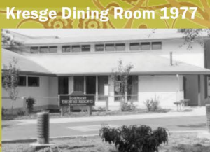
Kresge Dining Room 1977