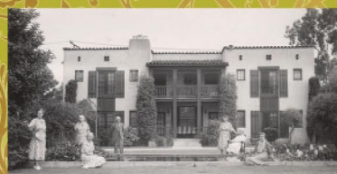
Atherton Villa, Burbank 1914