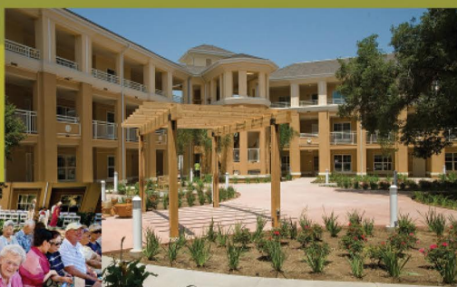
The Courtyard is completed in 2011