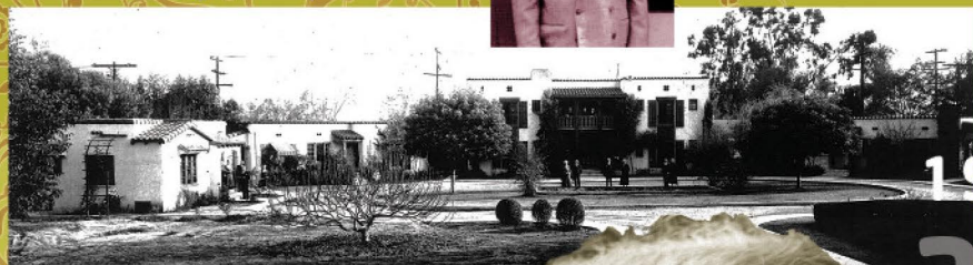
Early nursing staff at the Mary-Martha Cottage 1945