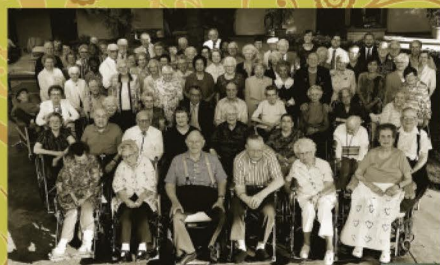
Retired Ministers and Missionaries April, 2004