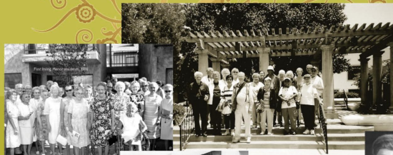
Joslyn Personal Care Facility