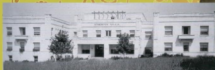
The start of a dream